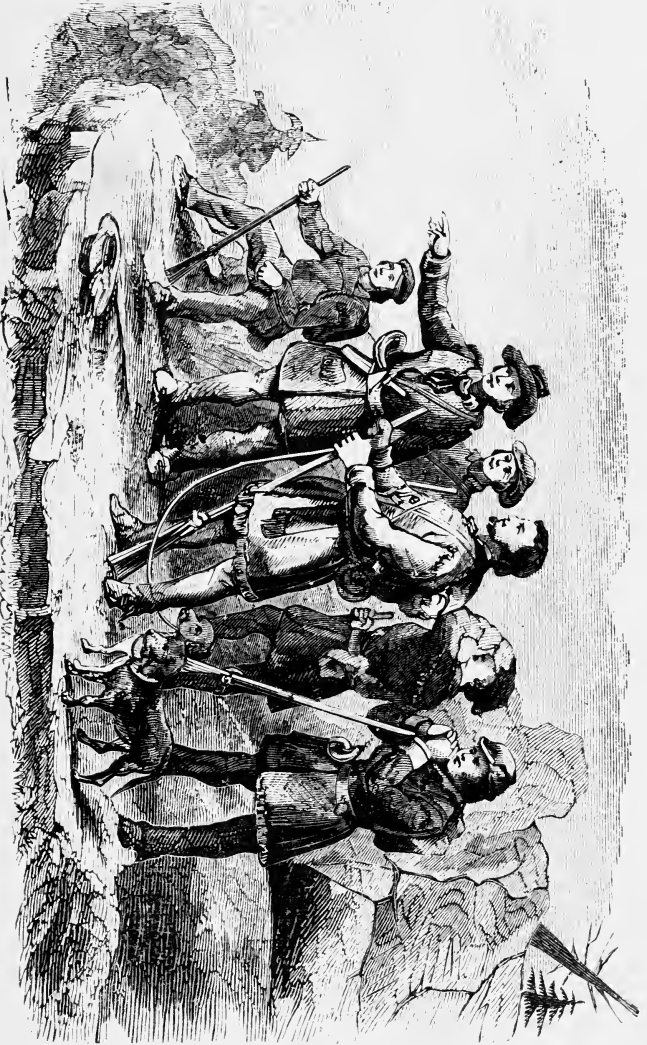
BONE'S FIRST VIEW OF KENTUCKY.